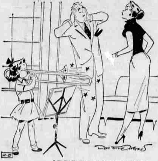
"You wouldn't want to see a shortage of all-girl orchestras!"