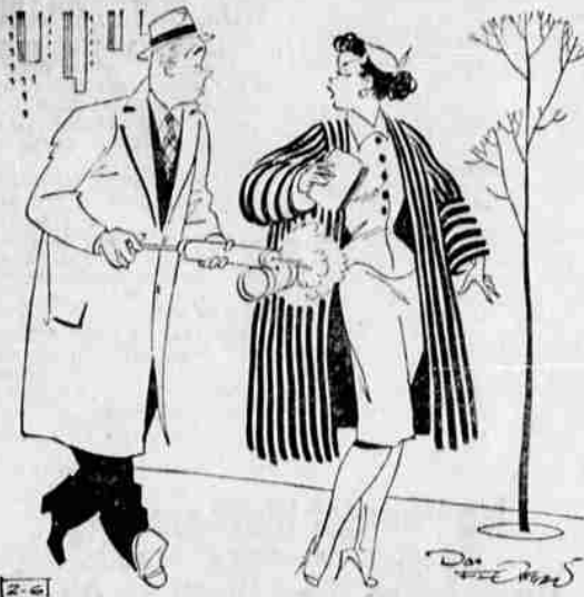
"Gerald, I wish you'd stop worrying about moths!"