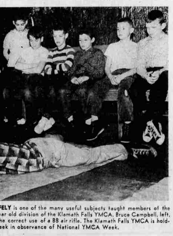
LEARNING TO USE GUNS SAFELY is one of the many useful subjects taught members of the Gra-Y Fun Club, the 9 to 12-year old division of the Klamath Falls YMCA.

ST. JOHNS, Nfld. (UP) — Five thousand American and Canadian airmen at the Goose Bay air base in Labrador are still digging out after the worst blizzard in the history of the base.