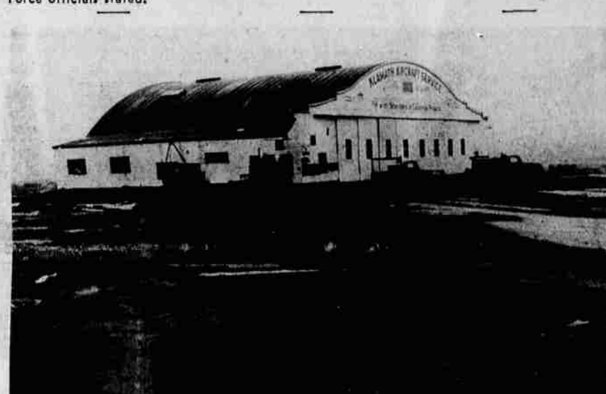
MOVING THE OLD WOODEN HANGAR at the Klamath Falls municipal airport was done last week by crews of Le Beck and Sons, Portland. A steel framework was built inside the building to support it during the stresses encountered in moving. It will be located on a site north of the steel municipal hangar on the airport flight line. The Le Beck firm is a sub-contractor for Schenk Construction Co., Portland, the original bid winner.