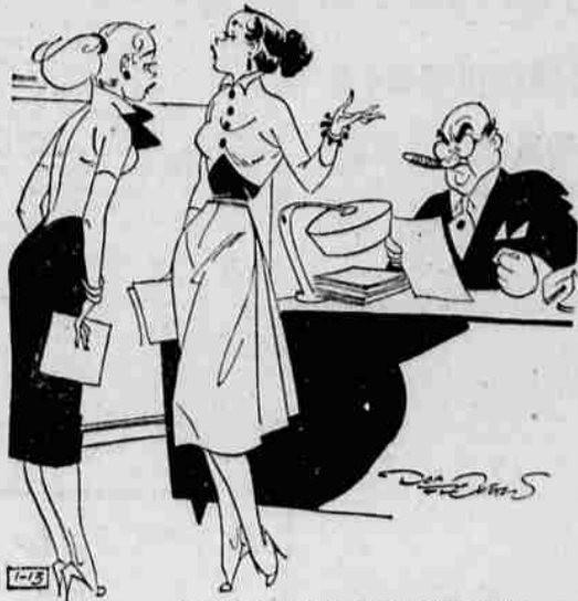
"Oh, no. This is one of his GOOD days."