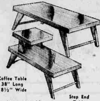
Coffee Table 38" Long 18 1/2" Wide

Clearance! NEW . . . MODERN Occasional Tables