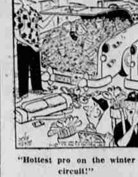
"Hottest pro on the winter circuit!"