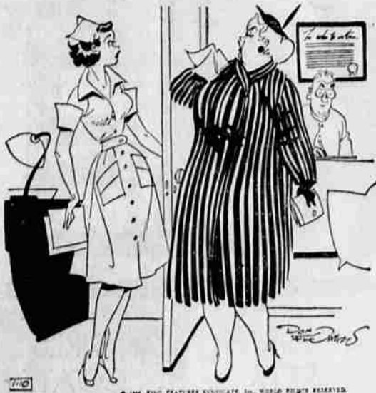
"How DARE he call mine a COMMON cold!"