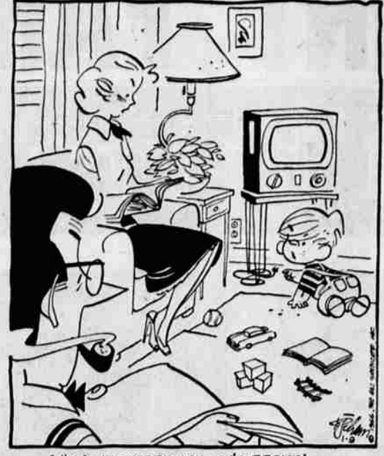
"HEY, THE TELEVISION ISN'T BROKE! IT ISN'T PLUGGED IN!"