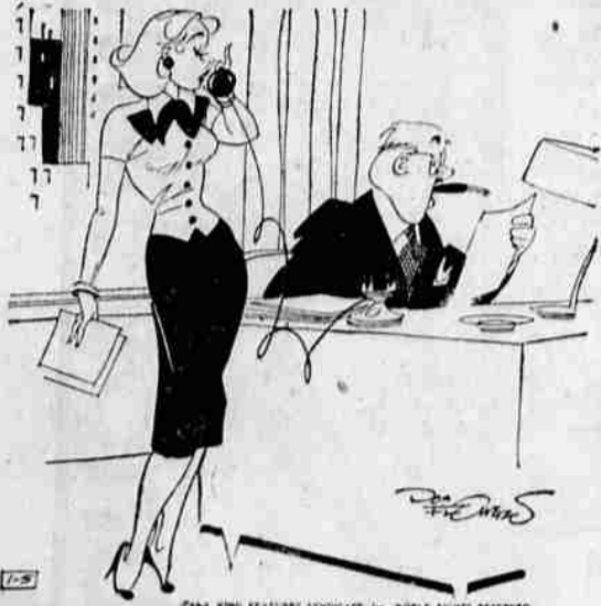
"It's your wife, sir. She says 'use the ashtray!'"