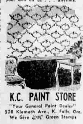
K.C. PAINT STORE "Your General Paint Dealer" 520 Klamath Ave., K. Falls, Ore. We Give Green Stamps

By JACK NEIPP IF YOU LOVE LIFE ... You love color! Think for a moment what a drab world this would be without color ... if everything you looked at were grey and colorless — the sky, trees, grass, flowers ... your clothes, your food, your home. If they were all without color, much of the beauty and joy of living would be lost. Color is one of the most important factors in home planning. With color, you can set a mood, enhance a style, make a whole room come to life. A feeling of elegance was desired in the dining room in the accompanying sketch. To achieve it, a color scheme of rich cedar green and oyster white was used. A wide, white cloverleaf mold crowns the wood dado and a bridge between the cedar green of the dado and the patterned wallpaper — green on a white background. If we don't have the colors you want in our ready mixed paint, we'll gladly mix them for you. We'll be most happy to assist you in any way that we can. If you wish, we'll recommend a reputable painting contractor to you. Call on us ... anytime.