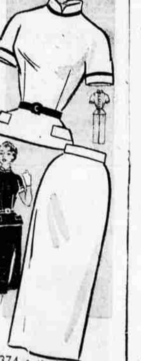
9374 by Marianne Martin

A must for the new season! The two-piece dress that's crisp, fresh, always smart! This one is as slender as a diet — slim, trim, sleek that whittles your figure to whistle size! Choose rayon, a lightweight wool, crisp cotton. Sew this style right now! Pattern 9374: Misses' Sizes 10, 12, 14, 16, 18. Size 14 takes 3 1/2 yards 39-inch fabric. This easy-to-use pattern gives perfect fit. Complete, illustrated Sew Chart shows you every step. Send thirty-five cents in coin for this pattern—add 5 cents for each pattern for 1st-class mailing. Send to Marianne Martin, care of Herald and News, Pattern Dept., 232 West 18th St., New York 11, N.Y. Print plainly name, address with zone, size and style number.