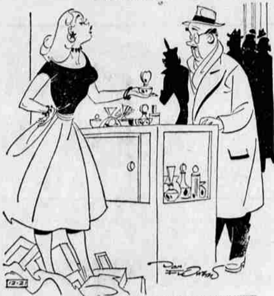
"$22.50 an ounce, sir. There is no large economy size."