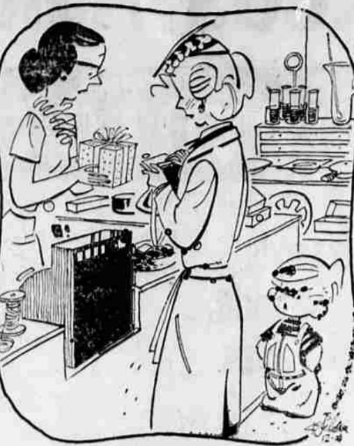
"HOW COME YOU HAVE TO PAY FOR IT? I THOUGHT THIS WAS A GIFT SHOP!"