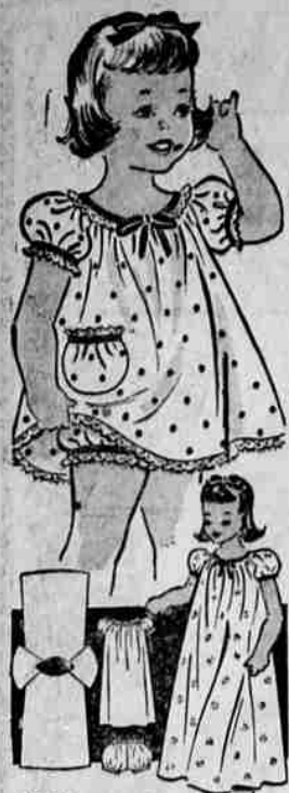
9215 2-10 by Marian Martin

Such a pretty way to send your little miss to sleep—wearing this newest shortie top, with matching bloomers beneath! Easiest sewing for you, mother—easy laundering in no-iron seersucker, please. An extra treat—make the graceful full-length gown too! Pattern 9215: Children's Sizes 2, 4, 6, 8, 10. Size 6 shorties top and bloomers, 2 1/4 yards 35-inch. This easy-to-use pattern gives perfect fit. Complete, illustrated Sew Chart shows you every step. Send thirty-five cents in coins for this pattern—add 5 cents for each pattern for 1st-class mailing. Send to Marian Martin, care of Herald and News, Pattern Dept., 222 West 18th St., New York 11, N.Y. Print plainly name, address with zone, size and style number.