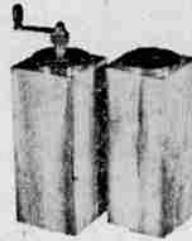
Peppermill & Salt Set

Dozens of items are pictured, described and priced in our FREE catalogue. Mail a card with name and address for your copy. We gift wrap and ship to any point in the U.S.A. So reasonably priced. So truly wonderful for giving.