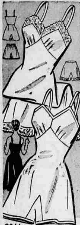
9366 36-50 by Marian Martin

Sizes up to 50 can make this 3-piece lingerie wardrobe in a jiffy! Graceful slip, chemise, panties—all proportioned for the larger figure; for comfortable, wearable fit. Easy to sew—in crepe, nylon, or plisse!