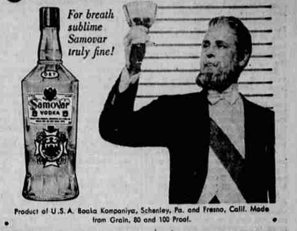
For breath sublime Samovar truly fine! Product of U.S.A. Bozka Kompaniya, Schenley, Pa. and Fresno, Calif. Made from Grain, 80 and 100 Proof.