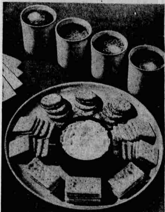
NIPPY-WEATHER SNACK features hot buttered soup. Try consomme or any other favorite soup and serve in mugs with zippy cheese dip and crackers. Just pour the soup, steaming hot, into big, comfortable mugs and then top each portion with a pat of butter for extra goodness.