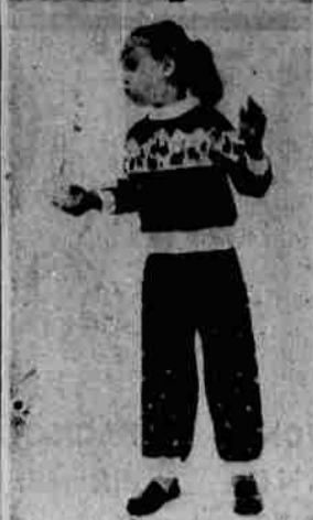
CHRISTMAS night this sleepy-time gal will be wearing her new skijamas of Sanforized cotton flannel, printed with a real peaceful snow scene across the yoke and sprinkled with snowflakes. Because Mom was careful to check the Sanforized label, these Style Undies will never shrink out of fit, no matter how many times they are washed.