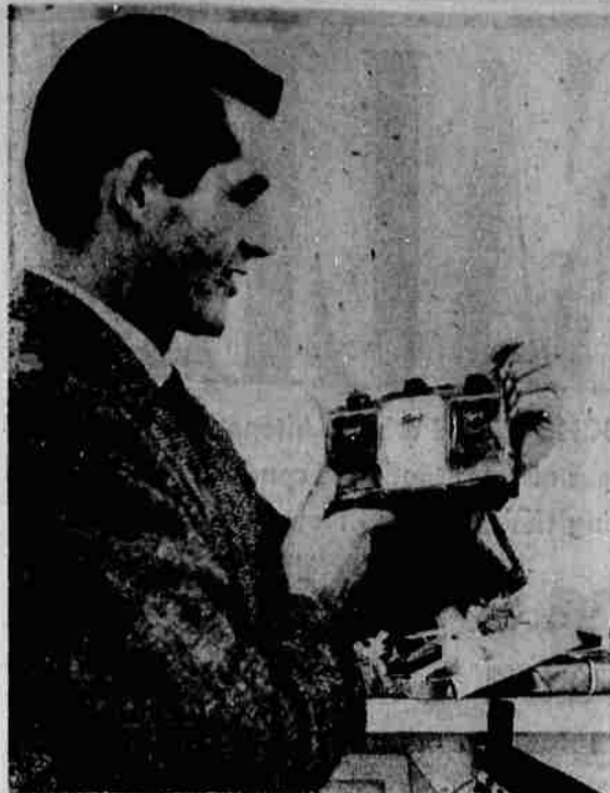
GOURIELLI blends luxury with practicality with the Tang Travel Kit containing three grooming necessities a man needs—After-Shave Lotion, Cologne, Talc—in easy-to-pack plastic bottles in a waterproof case. A truly elegant Christmas gift for a man.