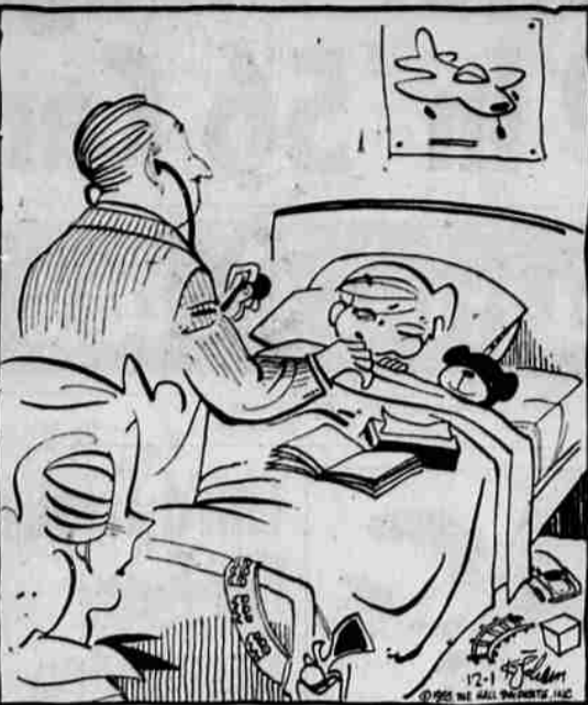
*WHY WON'T MY NOSE SHUT OFF?*