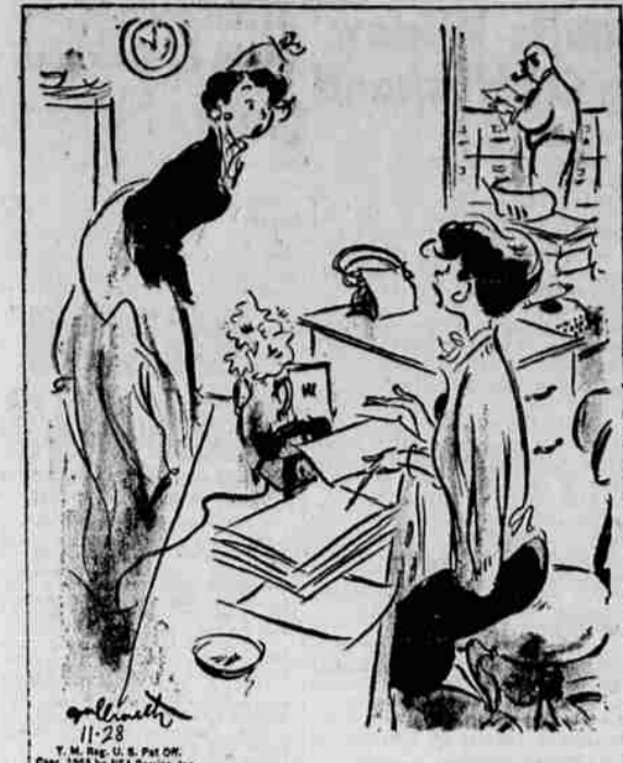
"Don't ask me, Miriam! I've decided it's easier to get to work on time than to be forever thinking up excuses for being late!"