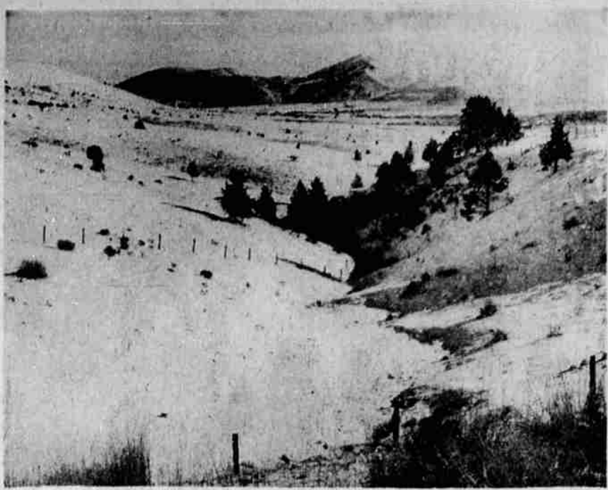
THE VIEW FROM OTI HILL gives one a good look at the south end of the Basin and the many ridges of Stukel Mountain as it rears above the fertile valley.

The tennis sweater has found new uses this year with the whole family wearing the familiar white, red and navy pullover for skiing, hiking and just plain relaxing.