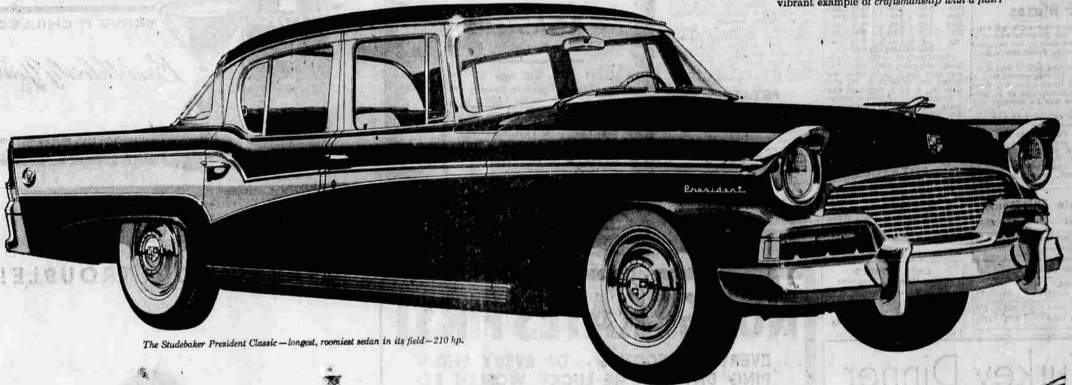
The Studebaker President Classic—longest, roomiest sedan in its field—210 hp.

Make way today for the one new car that stands out from all the rest—the big new Studebaker! Here's a really new look in the low price field. Longer, stronger lines, greater roominess, standout styling!