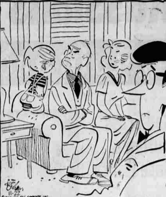
"CAN I SEE THE FIRST PENNY YOU EVER EARNED?"