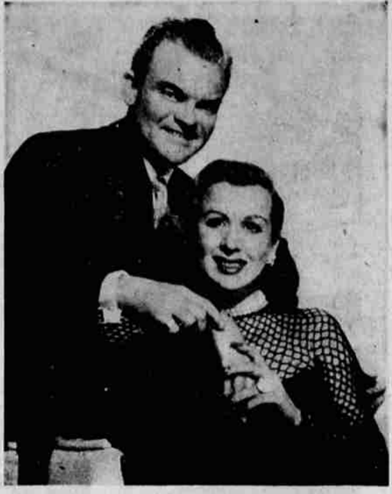
TWO STARS of Spike Jones "Musical Insanities of 1956" due at the Pelican Theater next Friday are pictured above. They are the wacky maestro of the musical show, Jones and his wife, Helen Grayco. The production is coming here under auspices of the Klamath Falls Lions Club. Performances are slated for 5:45 p.m. and 8:30 p.m. Reserved seats for the second show can be obtained at Derby's Music Store.