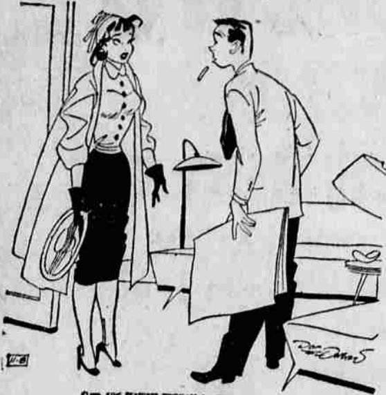
"Our wrap-around bumpers and wrap-around windshield are wrapped around a tree."