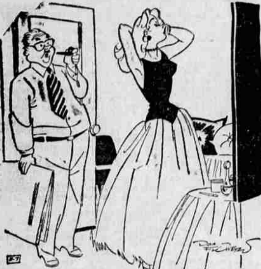
"And who are you keeping dangling tonight?"