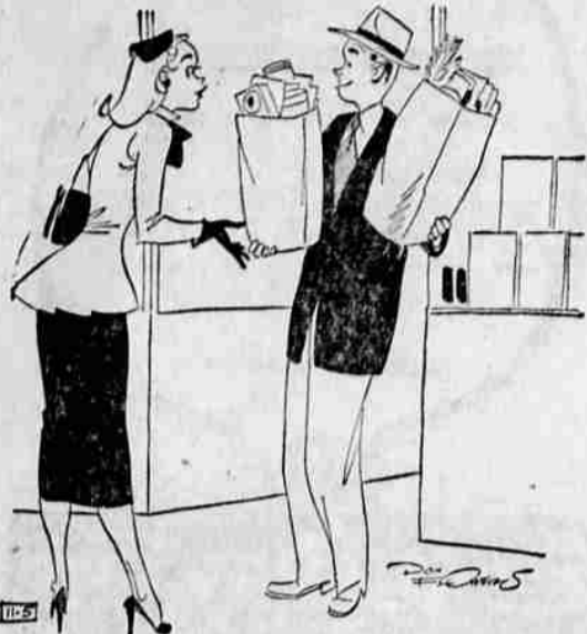
"How about coming right over to my house for dinner tonight?"