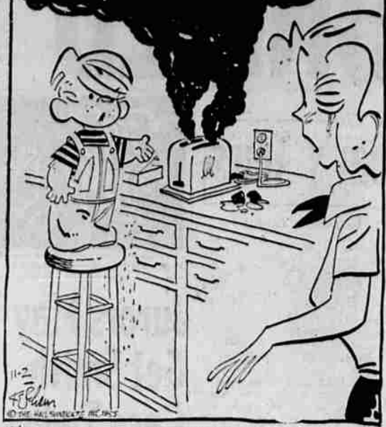
YOU BETTER TAKE THIS TOASTER BACK TO THE STORE! IT WON'T EVEN DO MARSHMALLOWS!