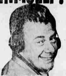
At last—the fabulous redhead himself tells the whole Godfrey story!