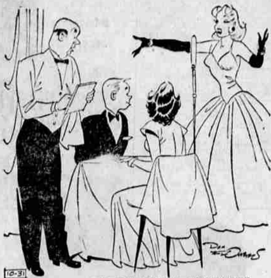
"Did I hear you correctly, sir? Just two peanut butter sandwiches on whole wheat?"