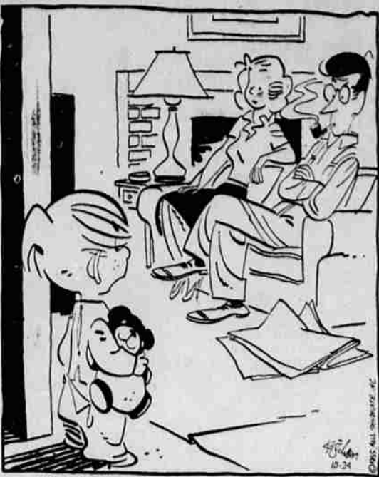
"IF I NEED SO DARN MUCH SLEEP, HOW COME I WAKE UP FIRST?"