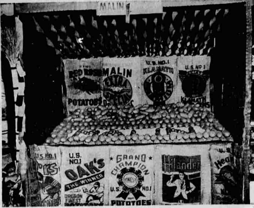
FIRST PRIZE FOR COMMUNITY BOOTHS at the Merrill Basin Potato Festival was awarded to this booth built by the Malin Chamber of Commerce Friday night.