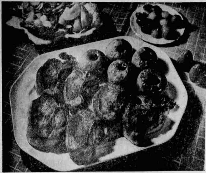
PLAIN OR FANCY PORK CHOPS are perfect for the autumn menu. Pork is an excellent buy in today's market and frequently on "special" in local stores. The platter shown here features pan-fried loin pork chops served with mincemeat stuffed apples. Photograph and cooking suggestions are from the National Live Stock and Meat Board in Chicago.