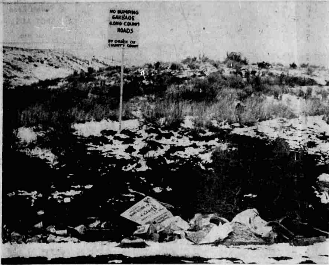
IT DIDN'T TAKE LONG for the people who dumped this pile of rubbish to clutter up a clean area. The "no dumping" sign was erected on February 24 of this year and the garbage was dumped at its foot on February 28. Vandalism of this kind leads not only to a dirty landscape but may extend into a menace to health.