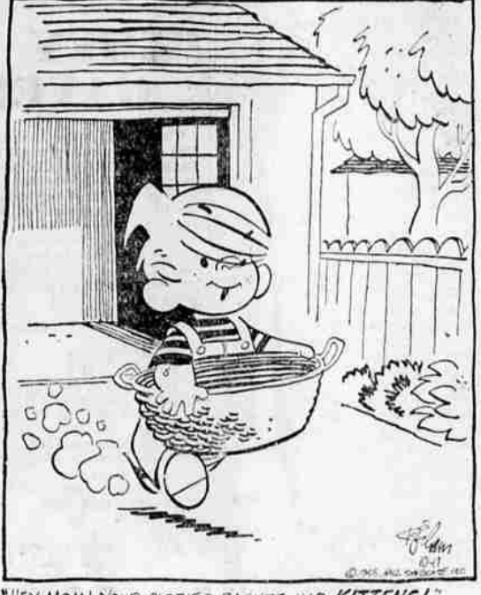
"HEY, MOM! YOUR CLOTHES BASKET HAD KITTENS!"