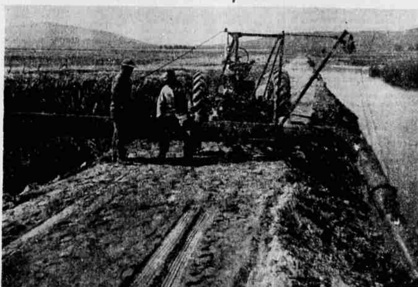
NEW GAME COMMISSION DITCH pump was recently delivered to the Oregon State Game Commission by the Valley Pump and Equipment Co. 2175 South Sixth Street. The pump will be used on the commission's Miller Island Road ranch. The purpose of the pump is to flood dry areas to provide feeding places for waterfowl. The capacity of the pump is 4,000 gallons per minute. Standing, left, is Willard Hubbard, game commission employe and Arthur Farr pump installer for Valley Pump.