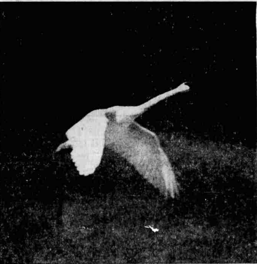
A SWAN IN FLIGHT is a beautiful sight as he soars high over the marshes and grasslands of the Basin, his high, flutelike call carrying for miles as he sweeps by overhead. Hunters are again cautioned to take an extra look before shooting to make sure they are not mistaking this big, majestic bird for the smaller snow goose which is legal fare for the scattergunner. The swan is marked not only by his great size but by black feet and bill and the absence of the black wing tips of the snow goose. This bird was snapped in flight over the Red Rock area in Montana. The big birds use almost all water areas of the Basin at this time of year.