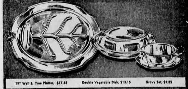
19" Well & Tree Platter, $17.55 Double Vegetable Dish, $13.15 Gravy Set, $9.85