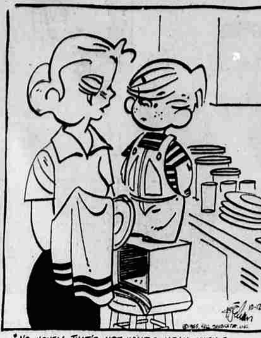
"NO, HONEY, THAT'S NOT WHAT I MEAN WHEN I SAY WE DON'T SEE EYE TO EYE."