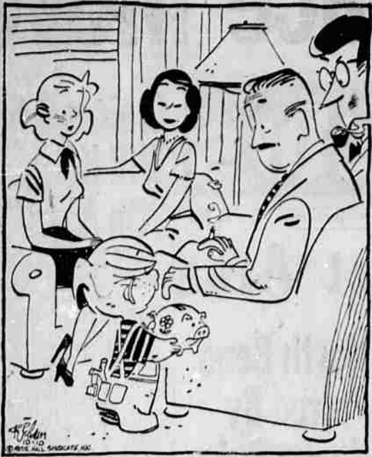
"GOT A QUARTER? I'LL SHOW YA HOW IT WORKS."