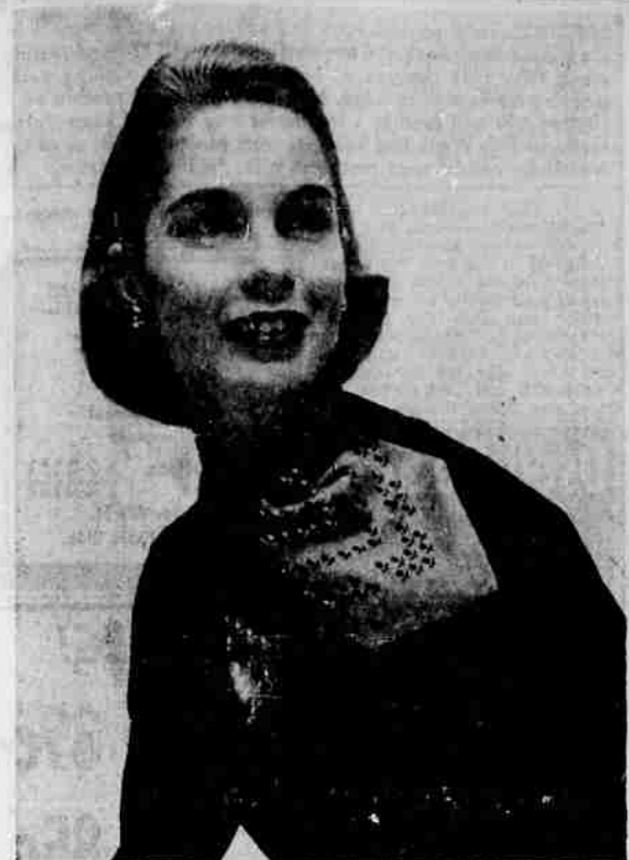
A TWILL ASCOT , epitome of tailored sophistication, is highlighted here by formal rows of tiny stylized flowers. The ascot comes in all high fashion colors and is from "Top-Hit." Available after October 1.