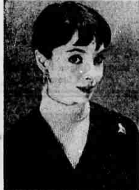
"TOP-HIT" features a reversible wool knit dickey, brushed wool on one side, plain on the other, to create an interesting contrast between collar and bib when the turtleneck is turned down. Nice contrast for your basic dress with a V-neck.