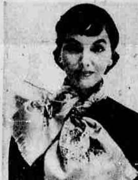
RIBBONS from France make this beautiful woven ribbon scarf from "Top-Hit." Lovely floral bouquets adorn the satiny sheet of the solid ground. A scarf that's certain to lend elegance to any wardrobe.