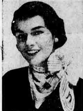
FEW SCARFS are as versatile as the big 36-inch square. Tie as sash, tuck it through a belt, drape it as a deep front bib with its ends tied in a soft bow (fold diagonally first for the effect pictured here). It always adds an interesting color note to your costume. Shown is one of "Top-Hit's" pure silk squares with an all-over geometric pattern.