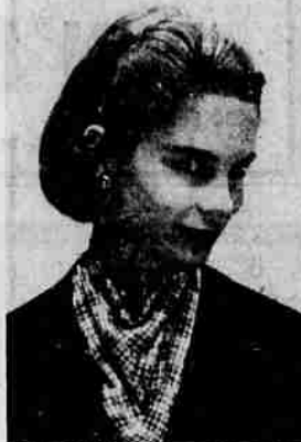
TOPS in fashion this season is the tweed pattern. Here "Top-Hit" has transferred the tweed pattern in muted tones to a 24-inch square of pure silk. Perfect to dress up the dress or suit with a V-neck-line.