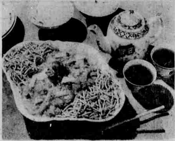
AN EXOTIC CHINESE DINNER at home is easy with any one of a number of pre-packaged Chinese dinners. These packaged dinners, plus a few extra trimmings to give it an authentic touch, is all you need for a meal with the most Oriental of airs.