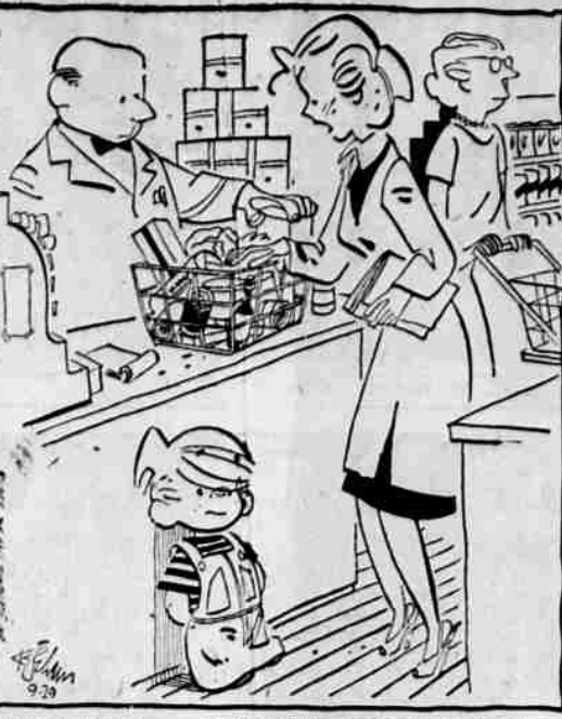
"WAIT A MINUTE... THERE WERE SUPPOSED TO BE FOUR BARS OF SOAP IN THAT BASKET!"