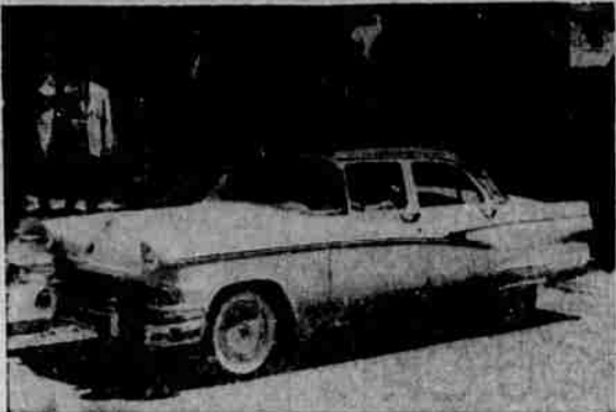
1956 FORD SEDAN IS OFFERED IN THREE SERIES, the Fairlane, Customline, and Mailine. Above is the Customline four door in one of the 21 two-tone paint combinations offered on models which will be displayed by Balsiger Motor Company Friday, September 23.