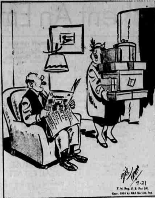
"I just love charge accounts; They go so much further than money!"