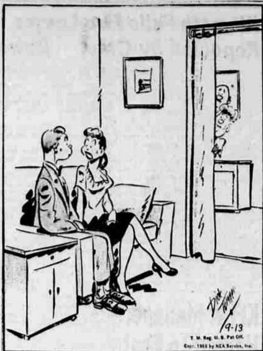
Just sort of casually mention how much money you make—otherwise they'll be pestering us all evening!