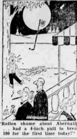
"Rotten shame about Abernathy had a first putt to break 100 for the time today!"