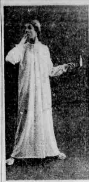
GRANNY GOWN is a new old favorite. The long, sweeping fullness and smocked neckline so reminiscent of the gown grandmother used to wear is making a welcome appearance this fall in the wardrobe of the back-to-school girl. Carter's Granny Gown, of softest cotton-knit in a blue or pink rosebud print may be worn loose or in peignoir style. Dainty ruffles of nylon lace trim the rounded, smocked neckline yoke.