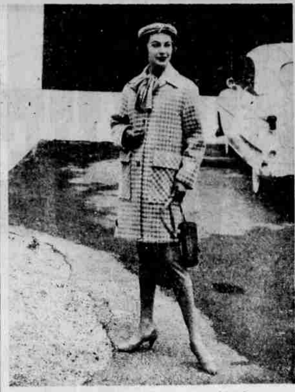
AN EXPANDABLE WARDROBE can be created by determining a basic color scheme. Here a coat of white and biscuit checked wool tweed is shown over a matching biscuit colored wool jersey dress with slim lines and a soft scarf neckline. The coat also harmonizes with suits and other dresses. The tunic-length coat has side slits, giant pockets and tapered set-in sleeves which lend to the longer, slimmer look of the season.