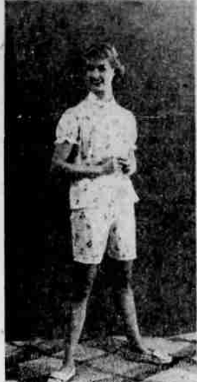
BERMUDA PANTS are featured for wintertime sleepwear. For collegebound girls, Carter's Wild Violet print Bermuda pajamas will be a dormitory delight. Of softest cotton-knit, so that washing is easy and ironing not necessary, the loose, Italian-style blouse with puffed sleeves and smocked bib-front falls loose and full over the Bermuda pants. The Wild Violets came in blue or pink on a white background.