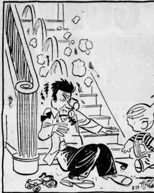
"DID YA WRECK THE SKATE?"