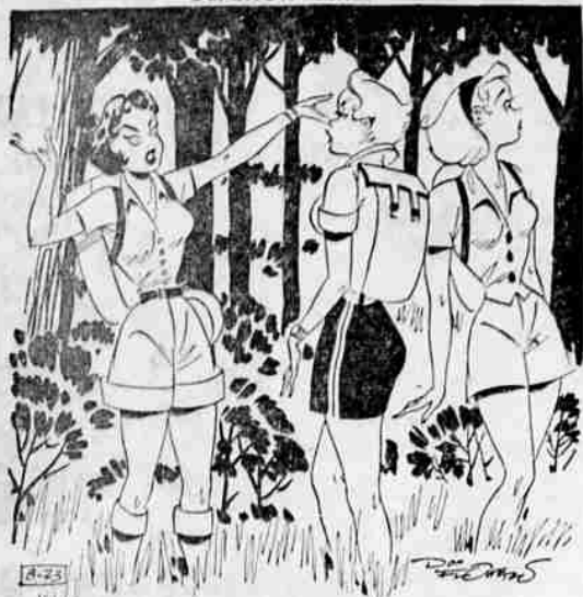
"I lost the compass! I lost the compass! I didn't want to come in the first place!"