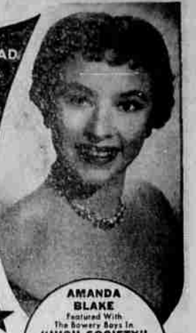
AMANDA BLAKE featured with The Bowery Boys in "HIGH SOCIETY" An Allied Artists Picture