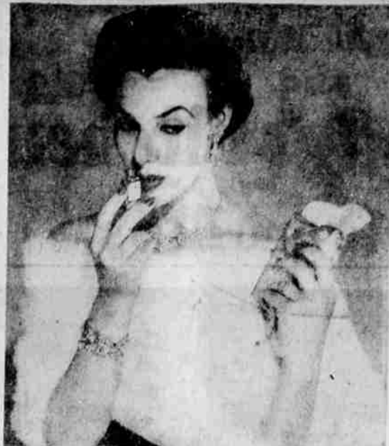
FALL GLAMOR calls for a glamorous scent, so change to Fame, straight from Paris. Corday's Fame perfume comes in a gilded flacon. It's a glamorous gift for the college girl for the first fall formal and to wear straight on through her exciting year on the campus.

Mix together the corn, carrot, pepper and onion. Blend eggs, salt and pepper into the cream sauce. Mix with vegetables. Place in buttered casserole and sprinkle cheese on top. Bake at 350 degrees for 45 minutes.